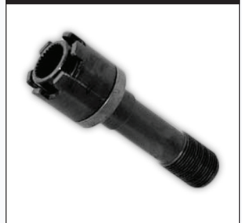
SS-HIGH TEMP/HIGH LOAD NUT

The Smart Stud's compact geometry makes it a suitable replacement for any fastener regardless of load or temperature.