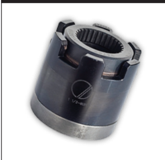
TN-COMPACT STYLE REPLACEMENT NUT

TN Series Clamps combine durability, efficiency & the ability to fit in tight spaces.