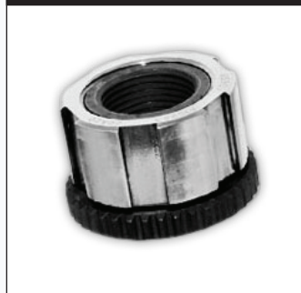
SN-LTD. OVERHEAD CLEARANCE NUT

The SN Series clamp line covers a wide range of sizes and applications, specified to overcome tight overhead restrictions.