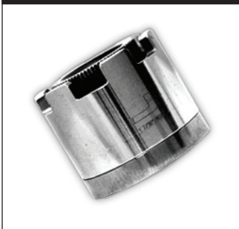
CN-PRIMARY REPLACEMENT NUT

The CN line offers users the speed of regular torque with unmatched repeatability and precision.