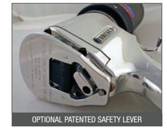
This safety mechanism drastically reduces operator error. The lever must be depressed while pulling the trigger, ensuring operator keeps hands away from pinch points.